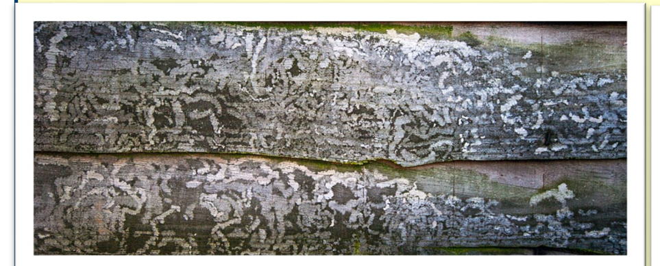
Marks on fence panel CB