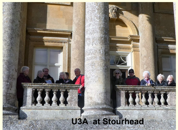
U3A at Stourhead