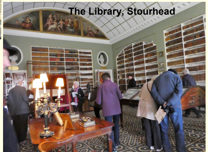
The Library, Stourhead